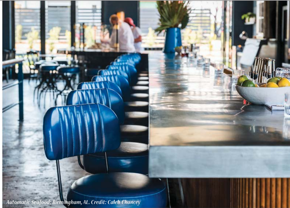
Automatic Seafood; Birmingham, AL.

This Huntsville-based dining establishment boasts world-class takes on all-time favorites. Order the PB&J wrapped in phyllo dough for dessert, and just try to leave without ordering another one for the road. For your actual meal, don't skip out on a round of the best classic fried green tomatoes followed by the braised Meyer Ranch beef short ribs.