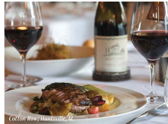
Cotton Row; Huntsville, AL

Head to downtown Auburn's famous Toomer's Corner and slip through the door with an "A" on the front for the coziest cocktail in town. This upstairs speakeasy-style lounge offers cocktails from master craftsmen, who can shake up something directly from the menu or whip up something bespoke just for you. With low lighting and delicious drinks, Avondale Bar will quickly become your favorite watering hole.